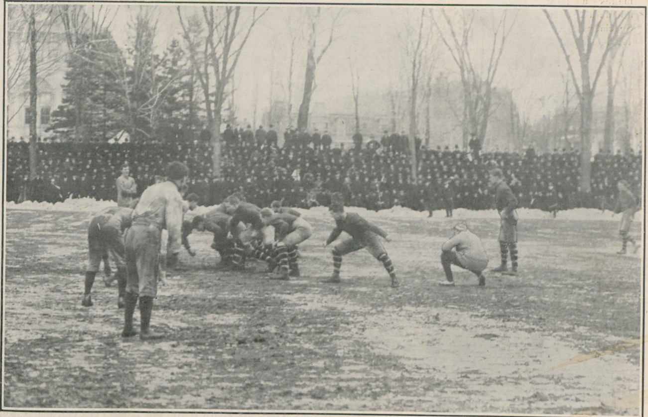
FOR THE CHAMPIONSHIP OF CANADA