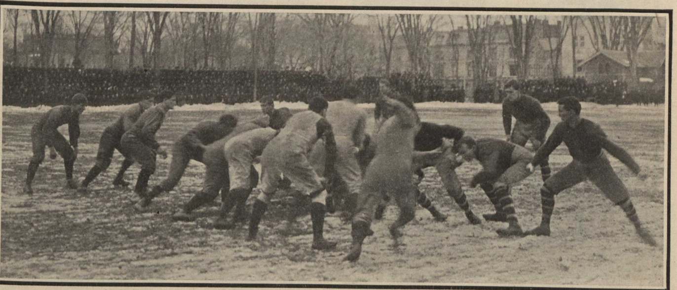
There once was a team--not the Nigers-- Who went out for a game with the Tigers ; They returned from the ride With McGill boys inside And a smile on the face of the Tigers.