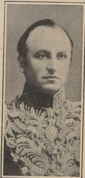
Baron Curzon of Kedleston