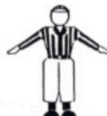
Both Arms Straight Out from Body - Forward Pass touched or caught by ineligible Receiver.