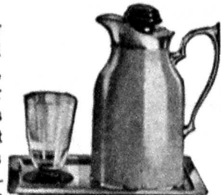
Bedside Set No. 177

● A Bedside Set or Jug which is practical for the guest room, sick-room or master bedroom. Jug holds 20 ounces and the set complete with tray is made in four colors—ivory, rose, blue and apple green. Price $9.00. Jug only $7.00.