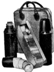
Picnic Outfit No. 283

● A popular outfit for the motor trip, when fishing or on a picnic. Strong leatherette case containing metal sandwich box, two Thermos 30 ounce vacuum bottles and four moulded cups. Price $13.50. Other sets $11.00 up.