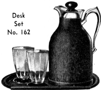
Desk Set No. 162

● If he has his own office, this Thermos Desk Set was meant for him. A handsome bakelite case jug with chromed lip and handle, bakelite tray and two glasses. Jug holds 32 ounces. Set $12.00. Jug only $9.50. Other sets and jugs from $8.50 to $25.00.